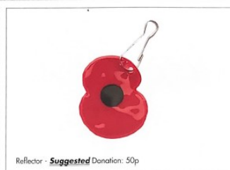
Reflector - Suggested Donation: 50p