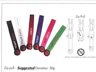
Zip pull - Suggested Donation: 50p