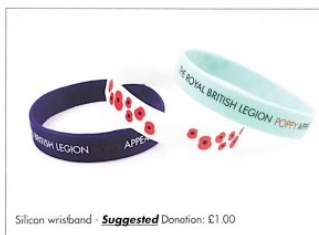
Silicone wristband - Suggested Donation: £1.00