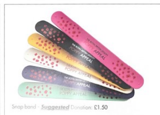
Snap band - Suggested Donation: £1.50