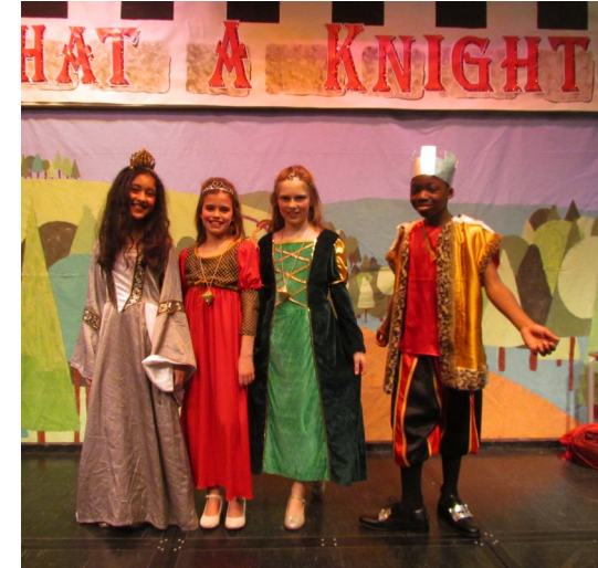
What I learnt about putting on a play: